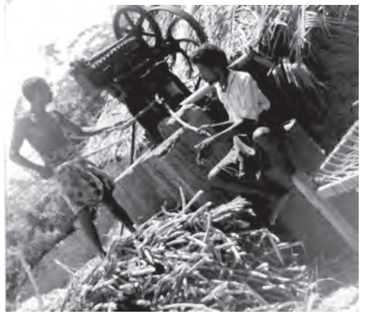
Fig. 5.2 Jaggery making is an allied activity of the farming sector

greater risk in depending exclusively for livelihood. on farming Diversification towards new areas is necessary not only to reduce the risk from agriculture sector but also to provide productive sustainable livelihood options to rural people. Much of the agricultural employment activities are concentrated in the Kharif season. But during the Rabi season, in areas where there are inadequate irrigation facilities, it becomes difficult to find gainful employment. Therefore expansion into other sectors is essential to provide supplementary gainful employment and in realising higher levels of income for rural people to overcome poverty and other tribulations. Hence, there is a need to focus on allied activities, non-farm employment and other emerging alternatives of livelihood, though there are many other options available for providing sustainable livelihoods in rural areas.