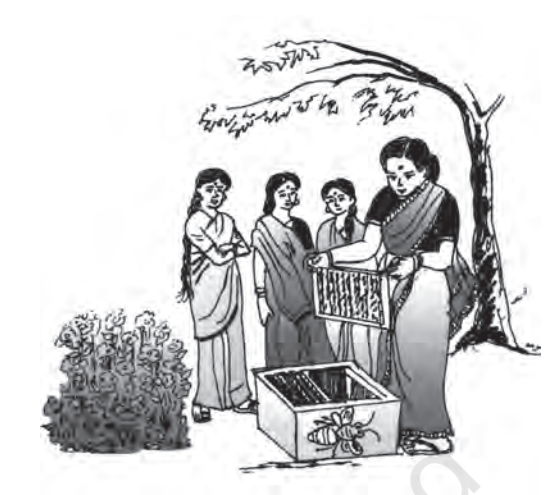
Fig. 5.5 Women in rural households take up beekeeping as an entrepreneurial activity

maintenance, hybrid seed production and tissue culture, propagation of fruits and flowers and food processing are highly remunerative employment options for women in rural areas.