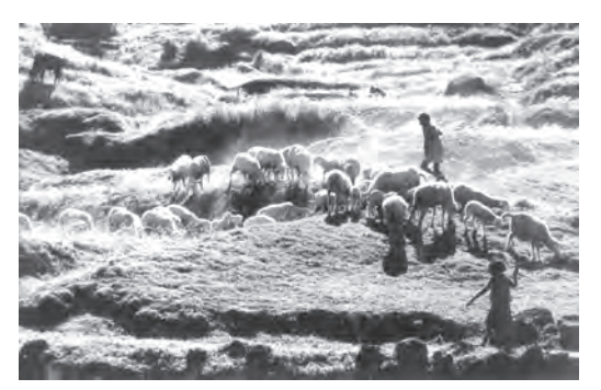
Fig. 5.3 Sheep rearing — an important income augmenting activity in rural areas

followed by others. Other animals which include camels, asses, horses, ponies and mules are in the lowest rung. India had about 303 million cattle, including 110 million buffaloes in 2019. Performance of the Indian dairy sector over the last three decades has been quite impressive. Milk production in the country has increased by about twelve times between 1951-2021. This can be attributed mainly to the successful implementation of 'Operation Flood'. It is a system whereby all the farmers can pool their milk produced according to different grading (based on quality), processed and marketed to urban centres through cooperatives. In this system the farmers are assured of a fair price and income from the supply of milk to urban markets. As pointed out earlier Gujarat state is held as a success story in the efficient implementation of milk cooperatives which has been emulated by many states. Gujarat, Madhya Pradesh, Uttar Pradesh. Andhra Pradesh. Maharashtra, Punjab and Rajasthan, are major milk producing states. Meat, eggs, wool and other by-products are