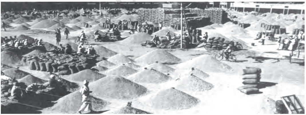
Fig. 5.1 Regulated market yards benefit farmers as well as consumers

Let us discuss four such measures that were initiated to improve the marketing aspect. The first step was regulation of markets to create orderly and transparent marketing conditions. By and large, this policy benefited farmers as well as consumers. However, there is still a need to develop about 27,000 rural periodic markets as regulated market places to realise the full potential of rural markets. Second component is provision of physical infrastructure facilities like roads, railways, warehouses, godowns, cold storages and processing units. The current infrastructure facilities are quite inadequate to meet the growing demand and need to be improved. Cooperative